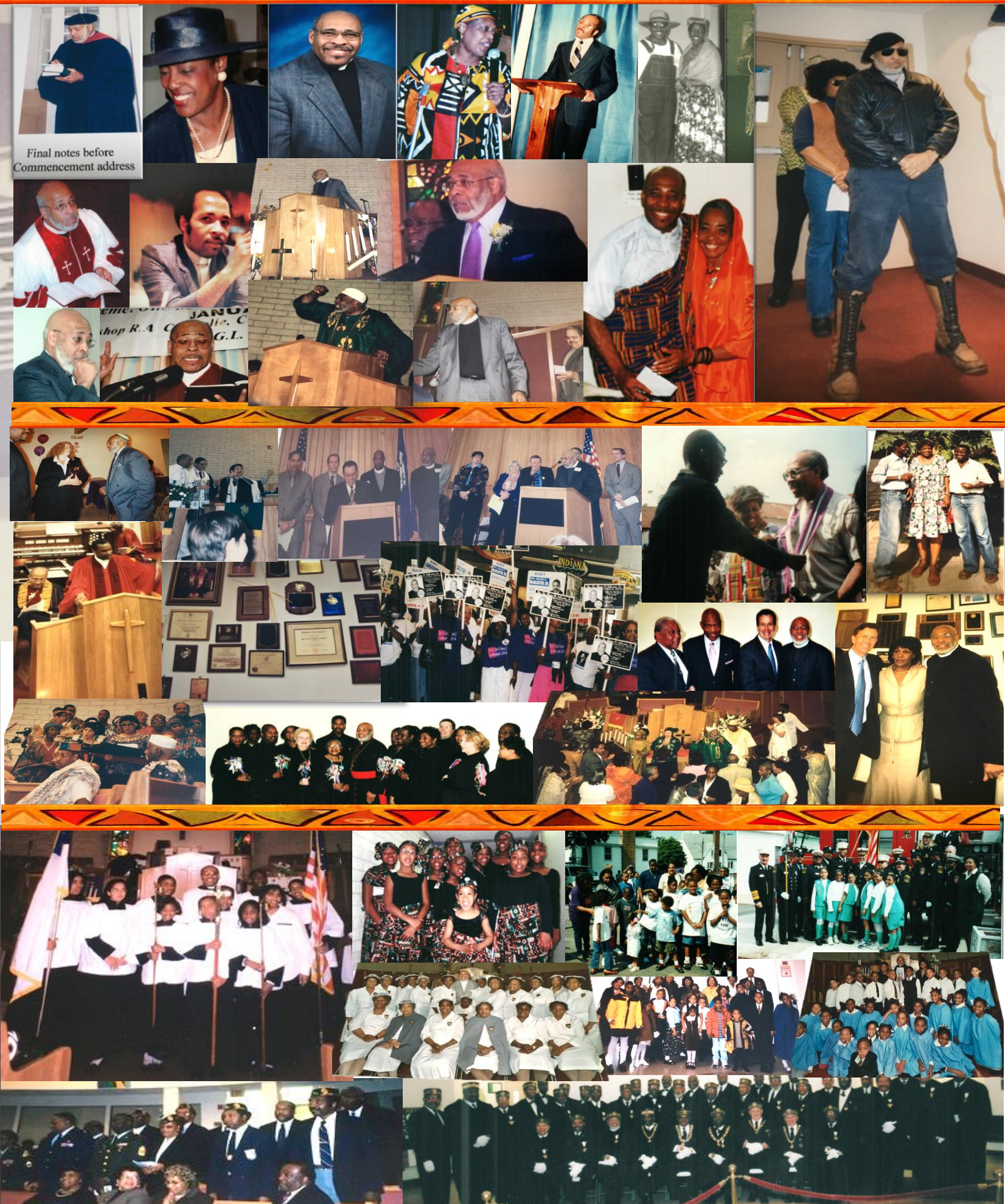
Final notes before Commencement address